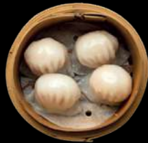
STEAM PRAWN DUMPLINGS (4) $9.3