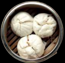
STEAM BBQ PORK BUNS (3) $7.8