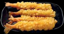
PRAWN TEMPURA (4) $10