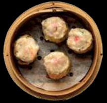
STEAM PORK, PRAWN & MUSHROOM DIM SIMS (4) $8.9