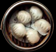
STEAM VEGETABLE DUMPLINGS (5) $7.8