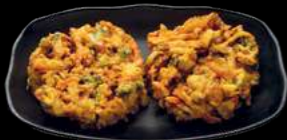
VEGETABLE TEMPURA (2) $7.8