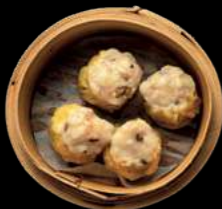
STEAM CHICKEN, PRAWN & MUSHROOM DIM SIMS (4) $8.9