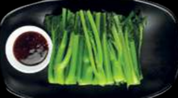
STEAM CHINESE BROCCOLI W/ OYSTER SAUCE $10 G