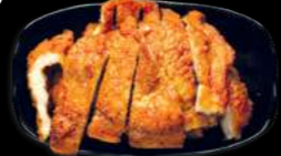
FRIED SATAY PORK CHOP $10